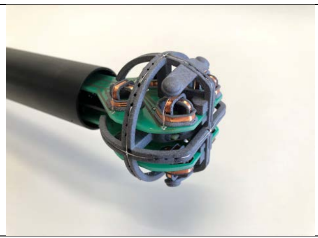
Test probe, without the casing