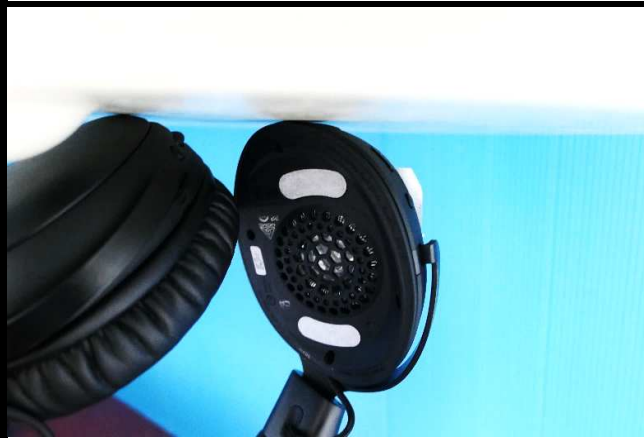
Bottom Side of EUT Tested at 0 mm