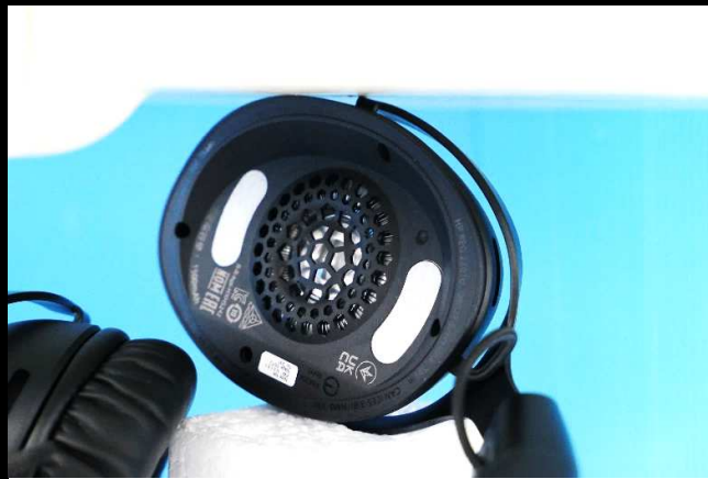
Rear Face of EUT Tested at 0 mm