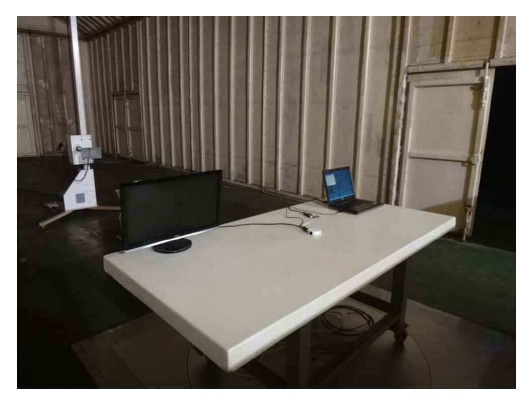
Back View of Radiated Test (Horn)