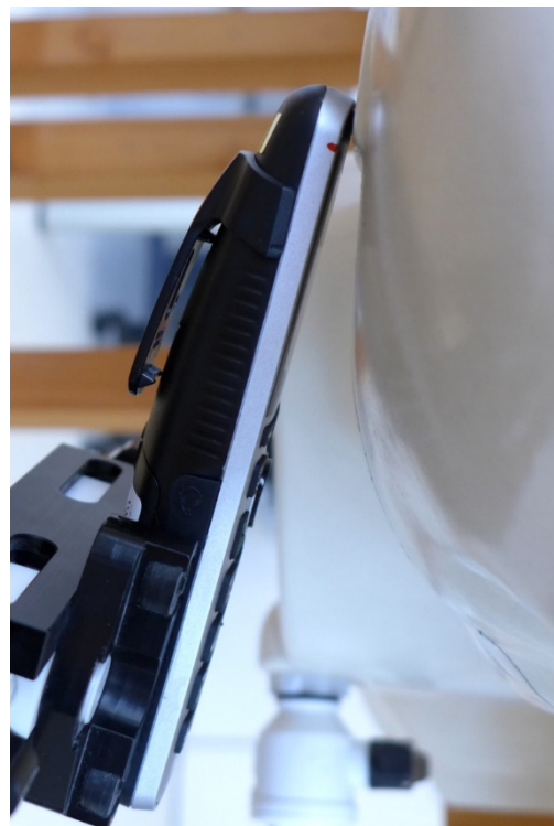
Pic. 6: Tilted position, right side.