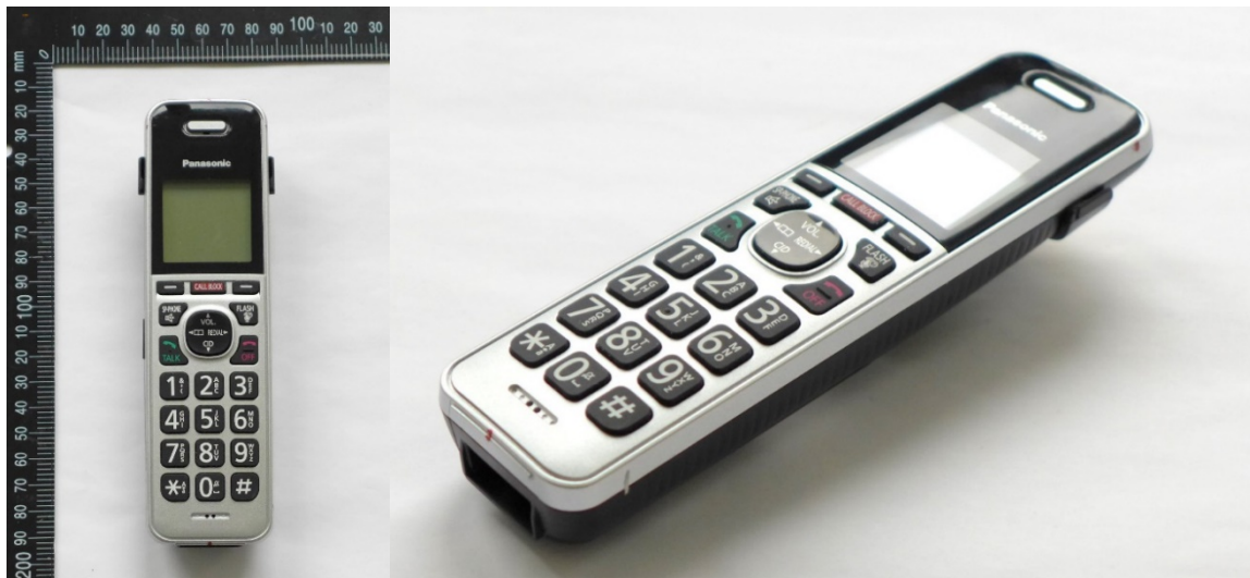
Pic. 1: Front side views of the device under test.