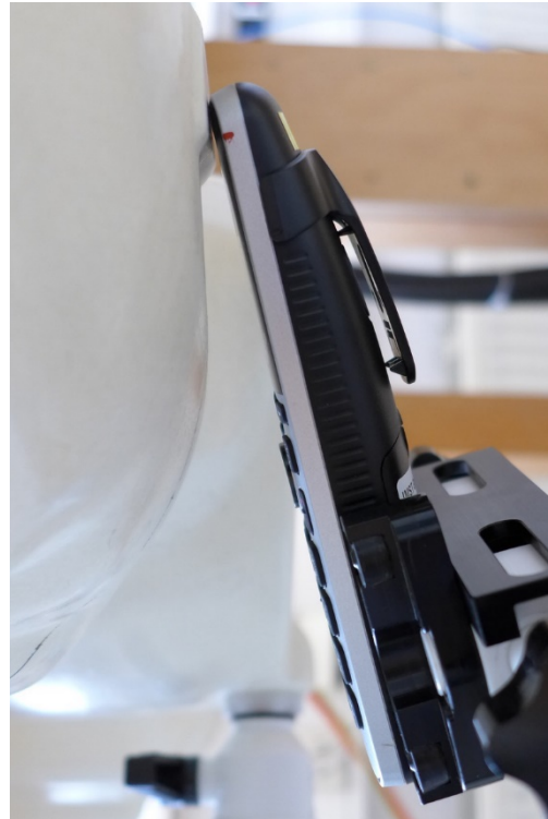
Pic. 4: Tilted position, left side.