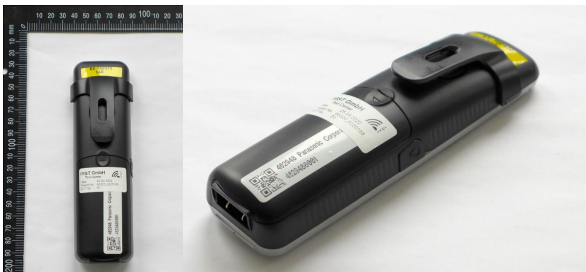
Pic. 2: Rear side views of the device under test.