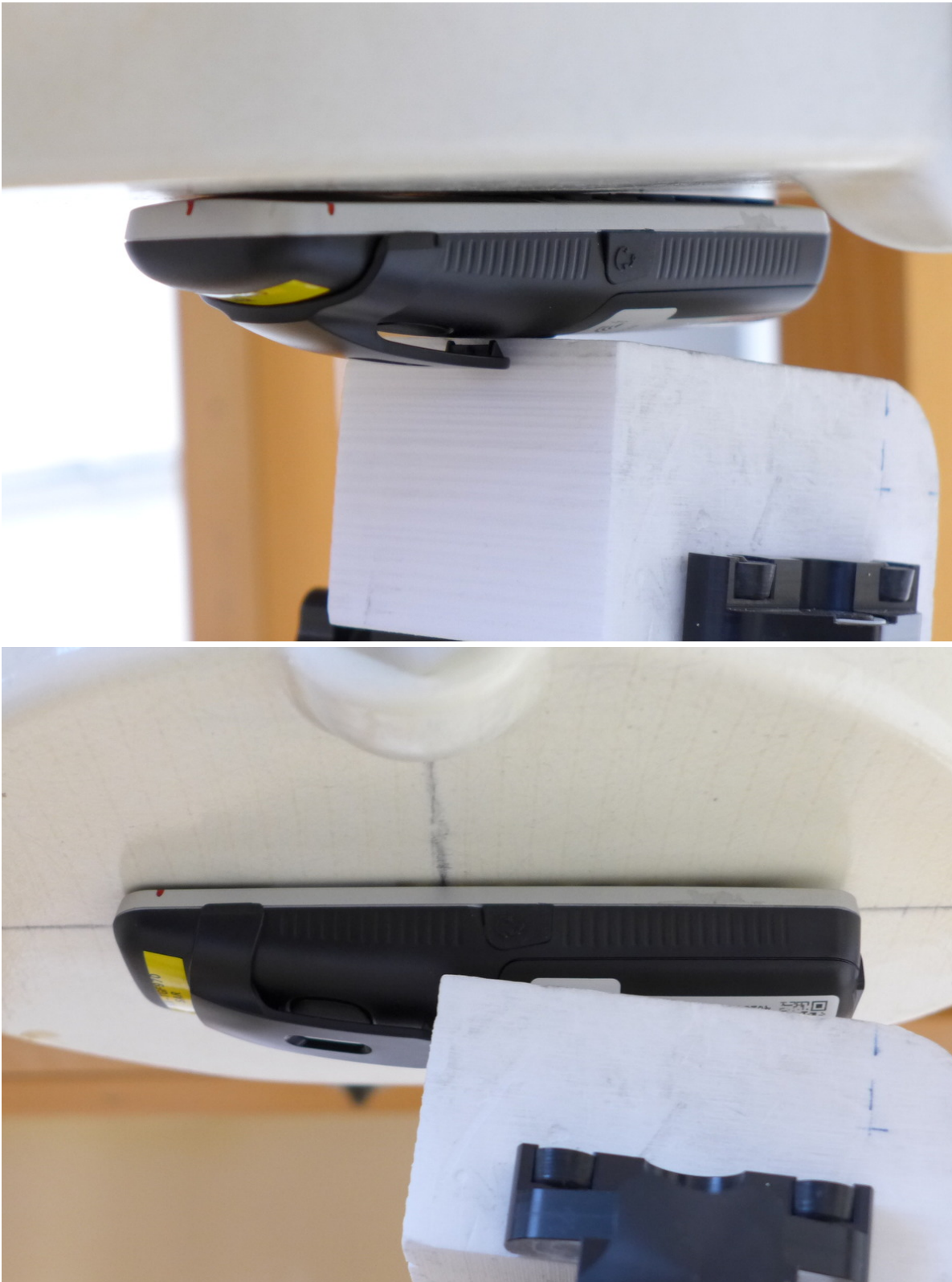
Pic. 7: Test position front side of DUT towards the phantom, 0 mm gap, belt clip attached.