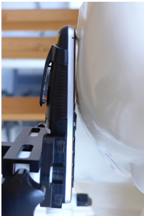
Pic. 5: Cheek position, right side.