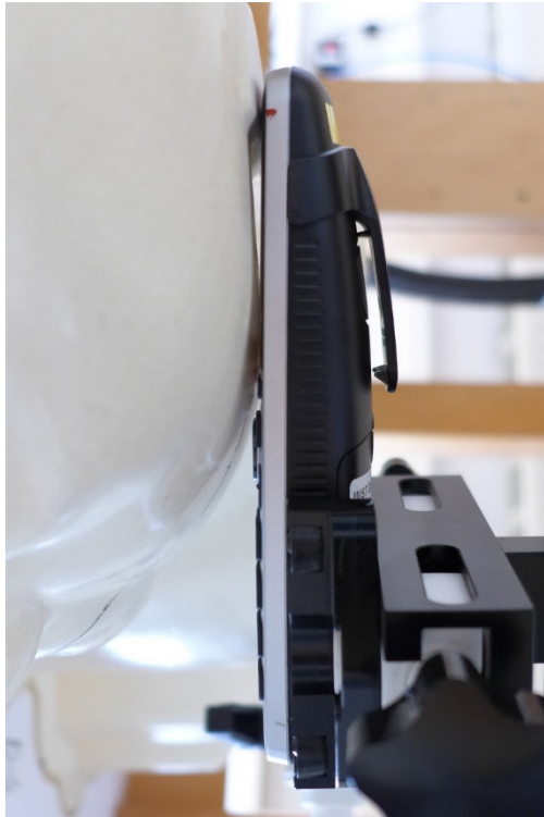
Pic. 3: Cheek position, left side.