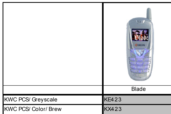
Figure 1 OVFKWC-KE423 Product Matrix

The phone will support certain CDMA2000 radio-configurations (RC) as describes in Exhibit 1 (operation description).