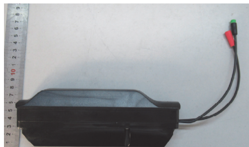
ZK105L with Red Circle Interface

Please contact me if there is need for any additional clarification or information.