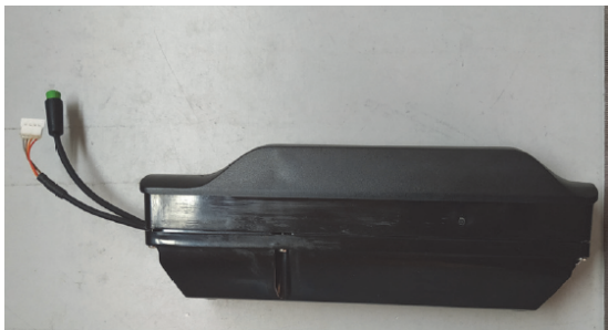
ZK105L with White Flat Interface

We, Queclink Wireless Solutions Co.,Ltd hereby declare that our product: LTE/WCDMA Advanced Scooter Tracker (Model: ZK105L, FCC ID: YQD-ZK105L). This product has two kinds of interface lines. They are all 4 PINs, and they all have the same functions. But one is a white flat, another is a red circle.