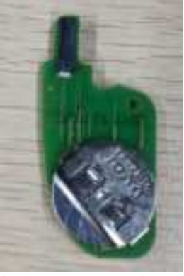
2, take the battery out and replace new one (Notes:the battery type is 2032 with 3 voltage,ensure the positive and negative of battery is correct)