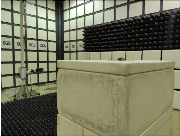
FCC 15_249 SRD Radiated Setup