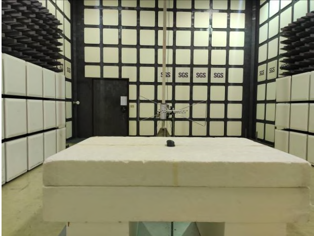
FCC 15_249 SRD Radiated Setup