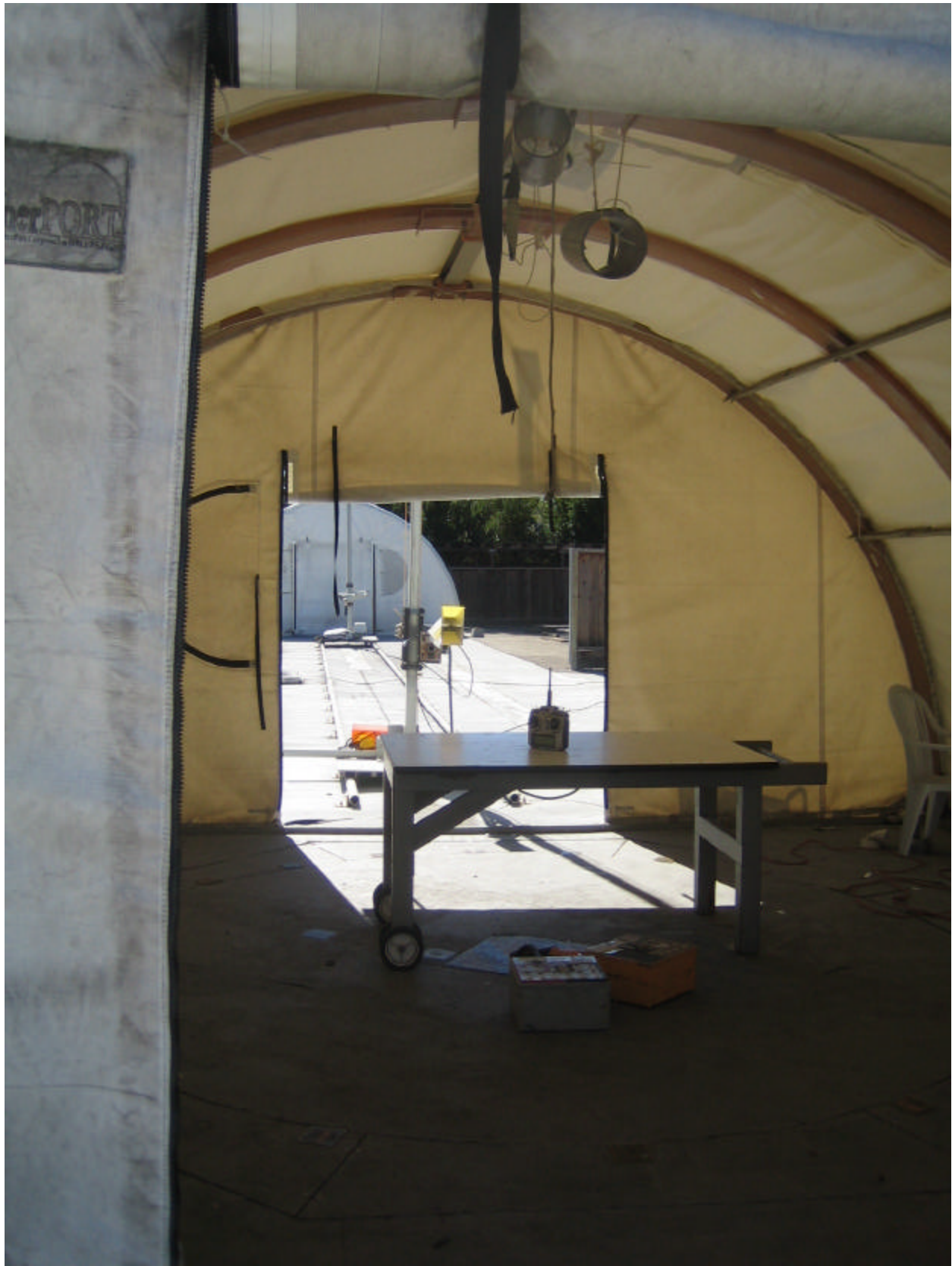
Test fixture upright for radiated emissions measurements