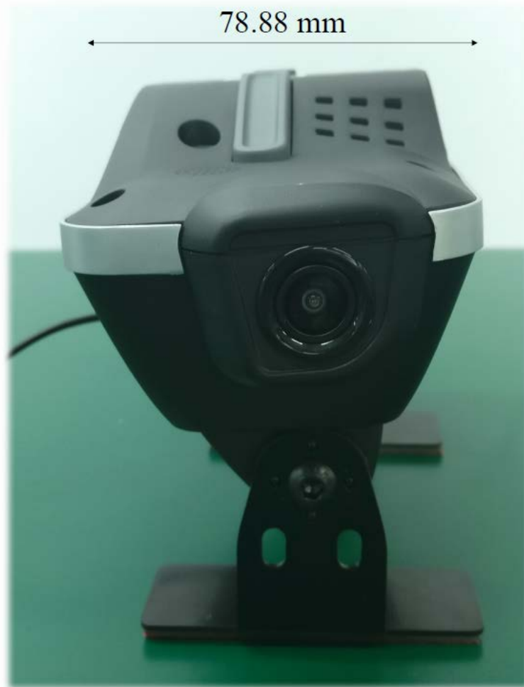
Device Left View