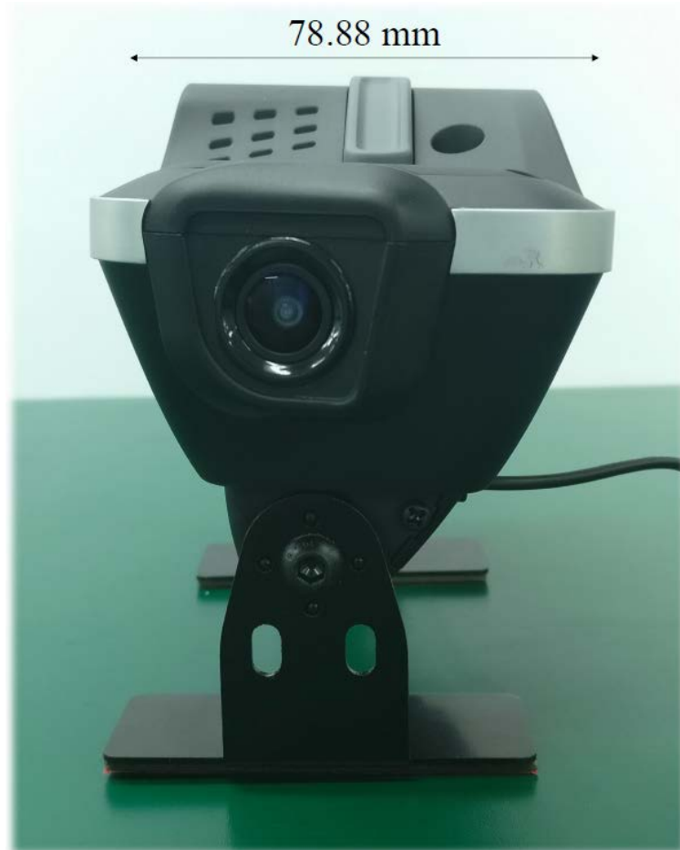
Device Right View