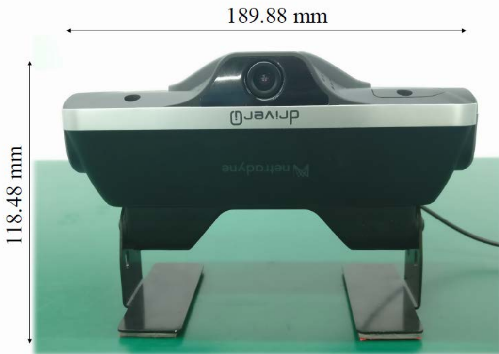
Device Front View