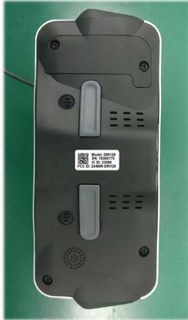
Device Bottom View