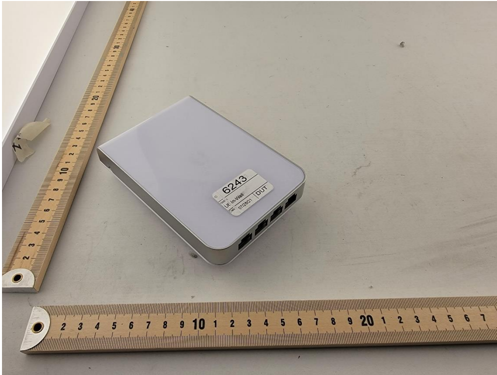
Photograph 1: Front, Left and Bottom View of DUT