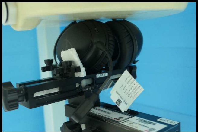
Rear Face of EUT With Microphone Battery SKU 1 Tested at 0 mm