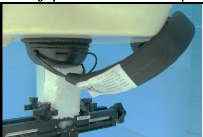
Left Ear of EUT Without Microphone Battery SKU 1 Tested at 0 mm