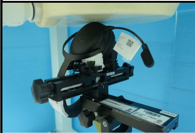
Bottom Side of EUT With Microphone Battery SKU 1 Tested at 0 mm