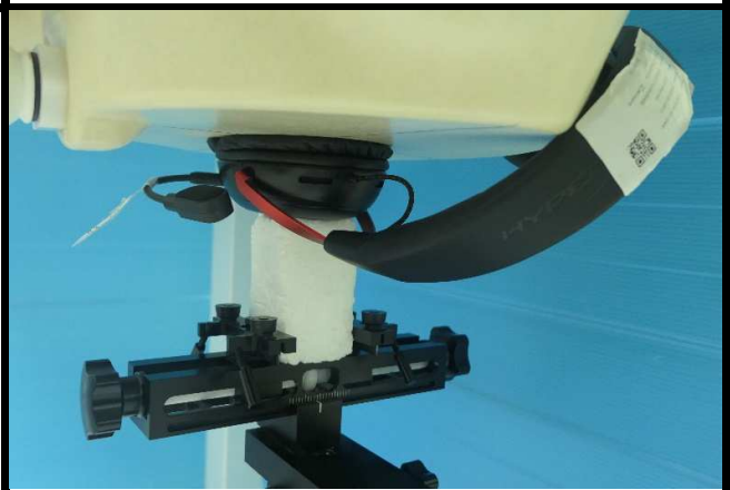
Left Ear of EUT With Microphone Battery SKU 2 Tested at 0 mm