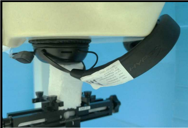
Left Ear of EUT With Microphone Battery SKU 1 Tested at 0 mm