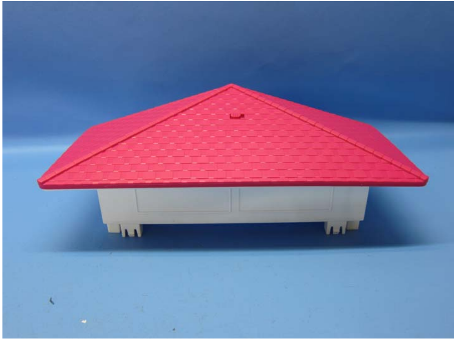
Figure 5 – Back view (Roof Unit)