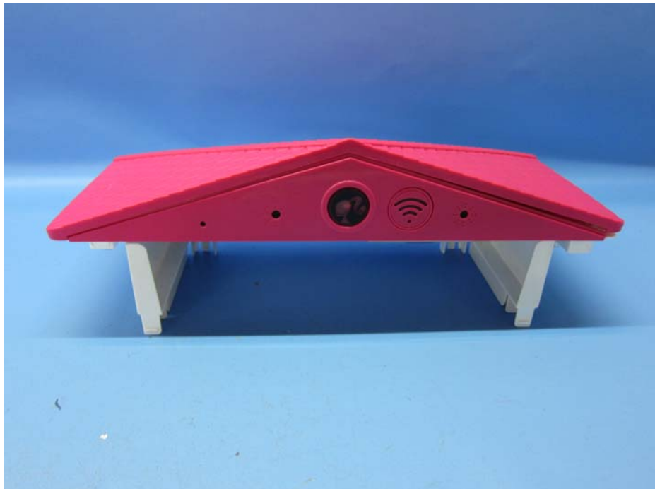
Figure 3 – Front view (Roof Unit)