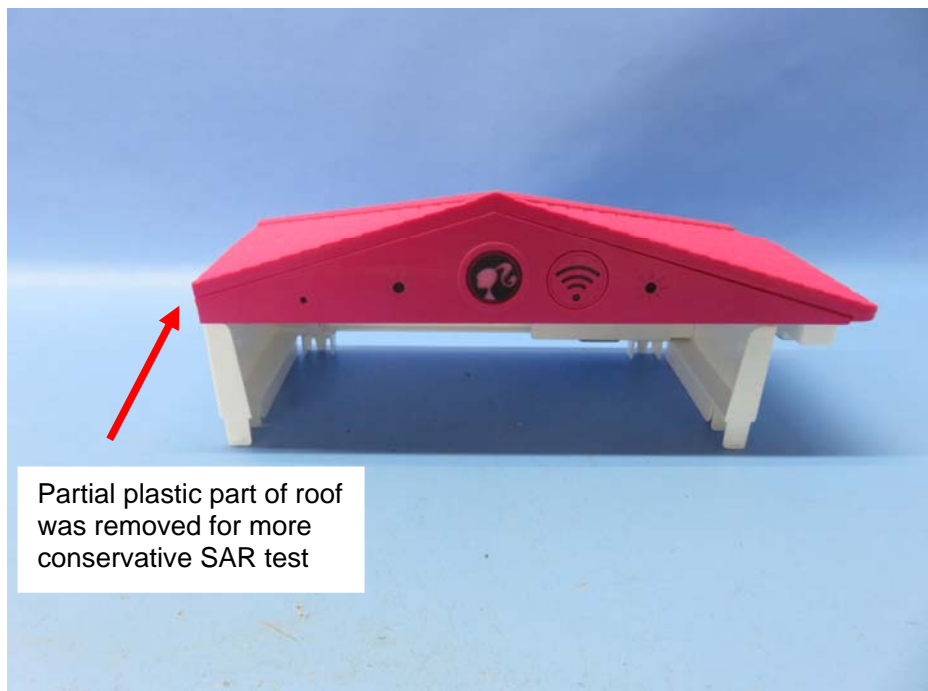
Figure 4 – Modified Front view (Roof Unit)