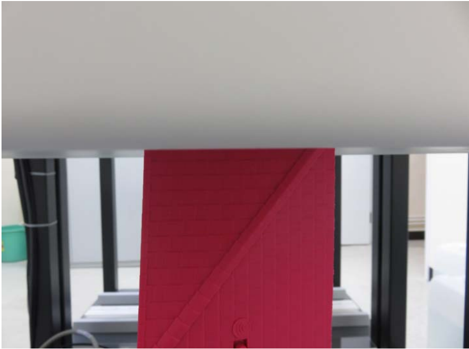
Figure 7 – Test configuration: Left 0mm