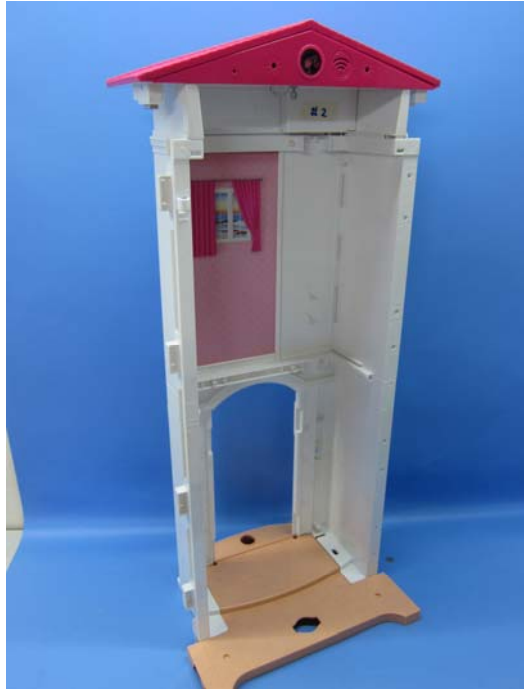
Figure 1 - Front view