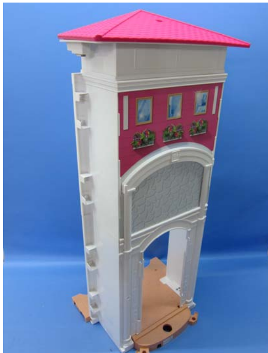
Figure 2 - Back view