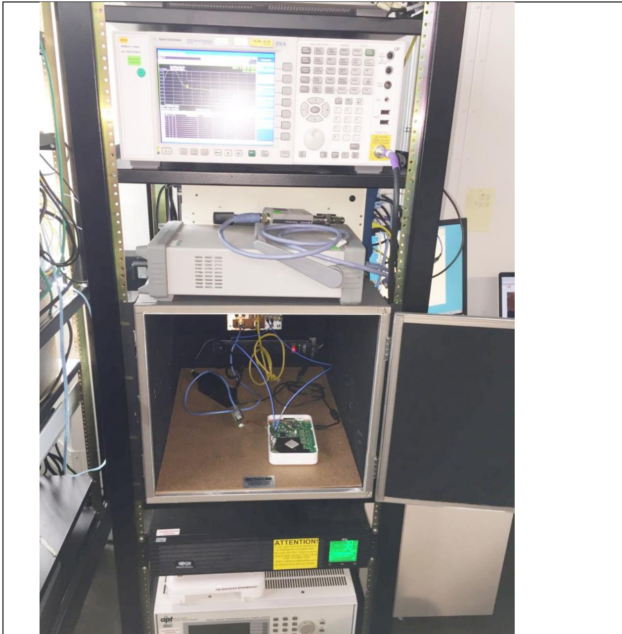
Title: Conducted Test Setup

This is a dual band 2.4GHz / 5GHz device. All ports in this test set up photo are connected as all testing is automated. Section 2.6 of this test report given an overview of the different Tx antenna combinations used by this device.