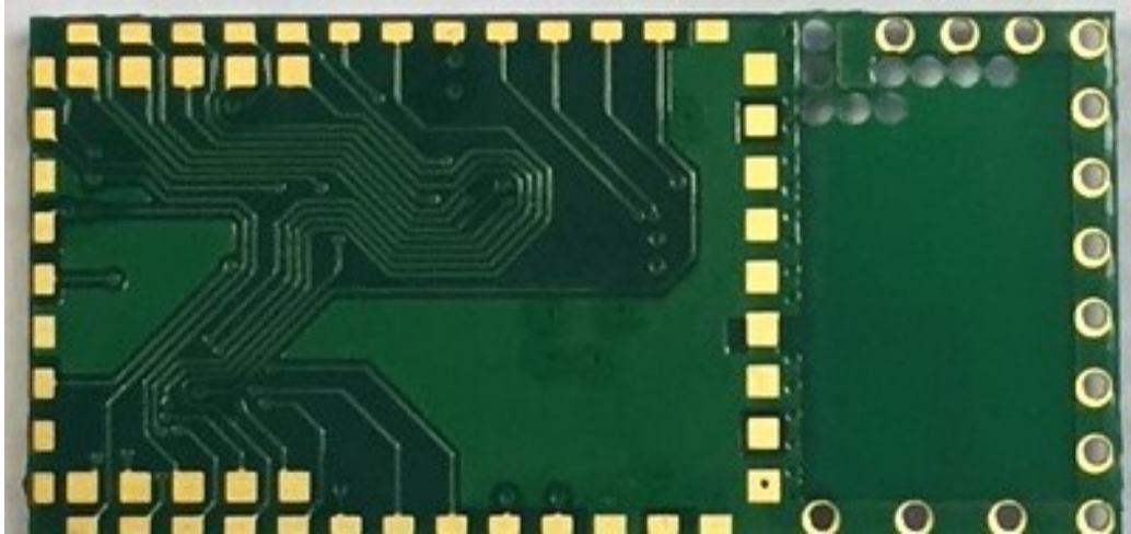
Figure 2. Radio Module PCB, Bottom

FCC Part 15 Certification O7P-903 10147A-903 17-0162 October 3, 2017 Inventek Systems ISM43903