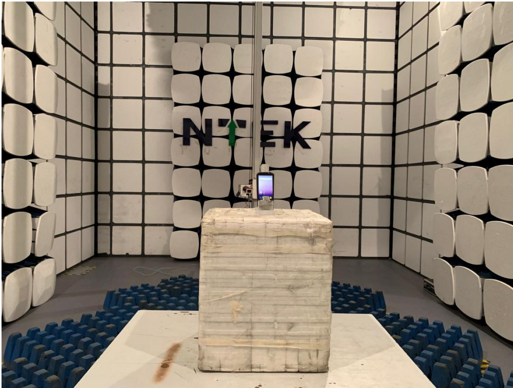
Conducted Measurement Photo