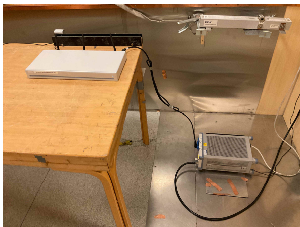
Power-Line Conducted Emissions