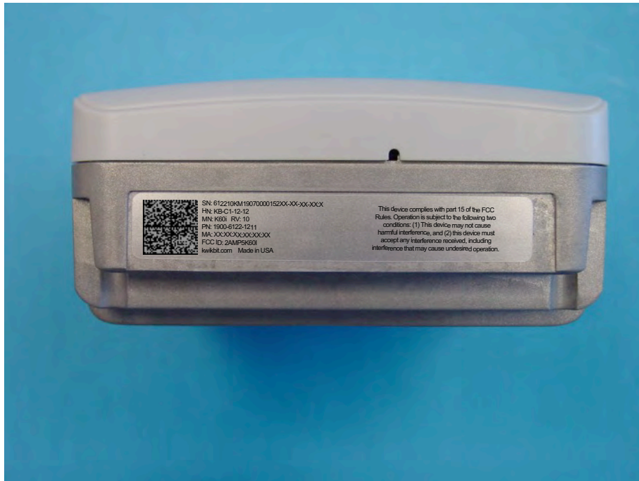
Side view showing Serial Number / Regulatory ID Label location.