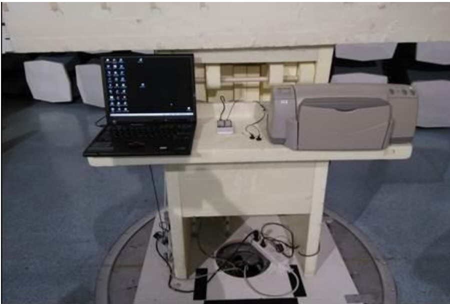
Picture 3. FCC Part 15B Radiated emissions, computer peripherals