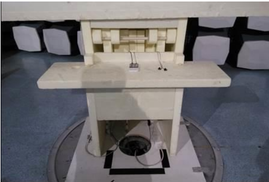
Picture 2. FCC Part 15B Radiated emissions