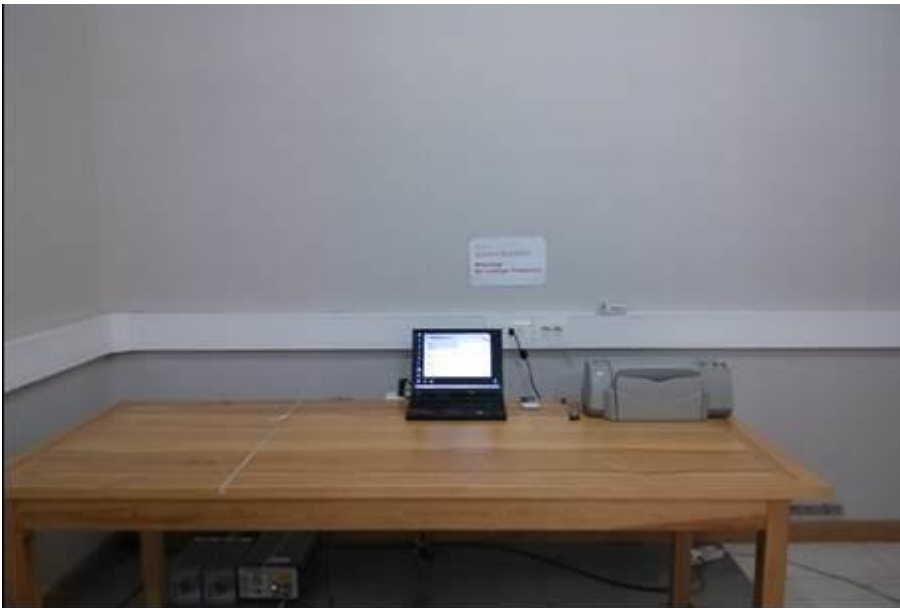
Picture 5. FCC Part 15B AC powerline conducted emissions, computer peripherals, measure from PC charger