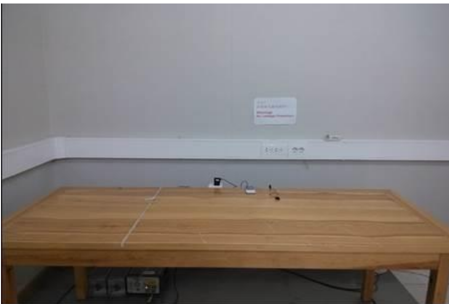
Picture 4. FCC Part 15C AC powerline conducted emissions