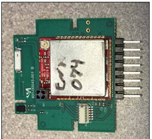
Figure 1: Top View with Shield