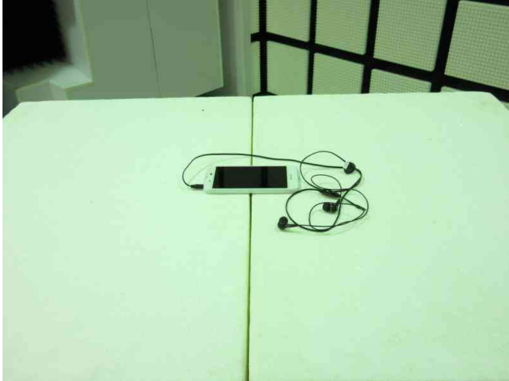
– X-axis –