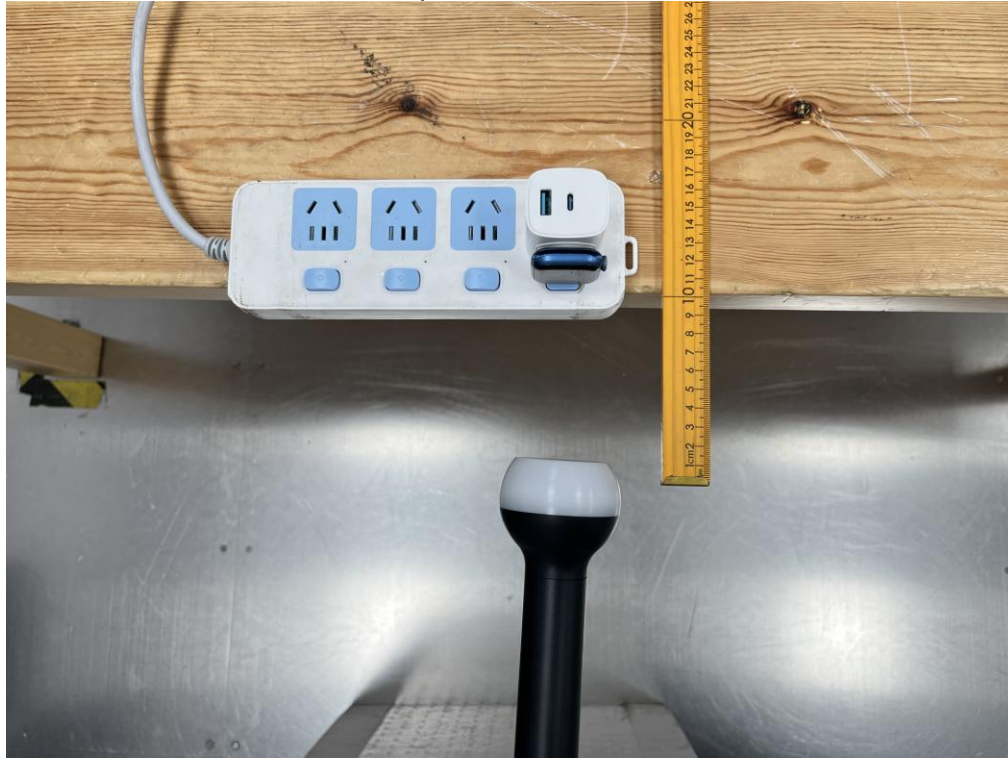
Top Position E