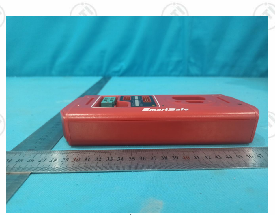
View of Product-4