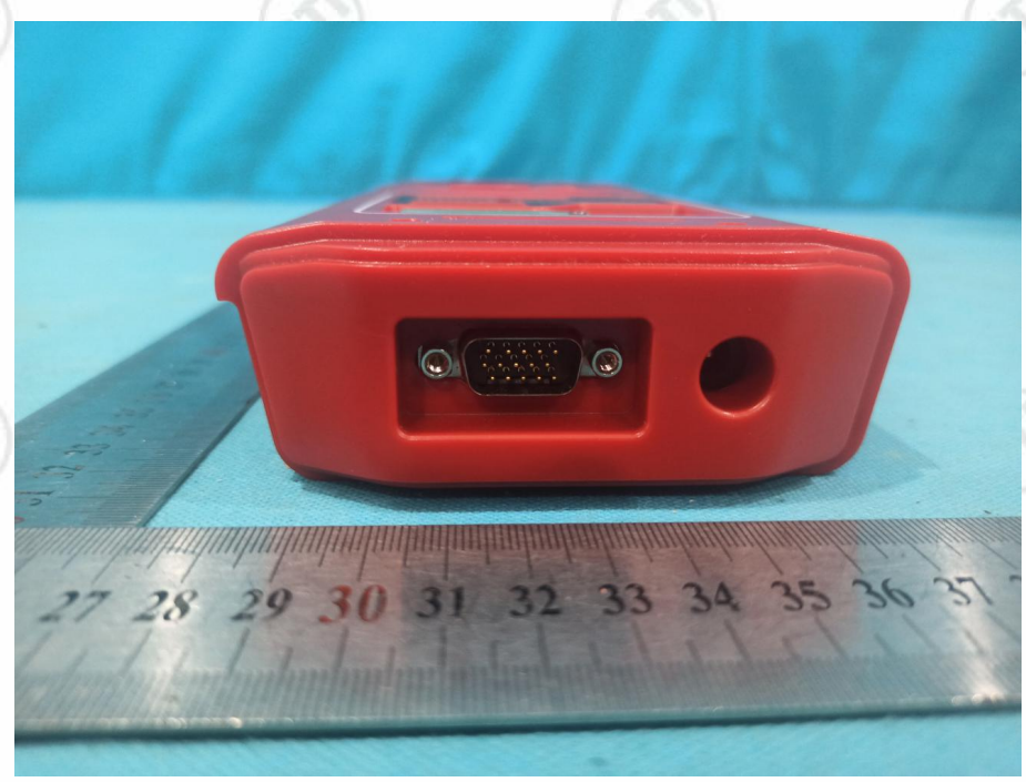
View of Product-5