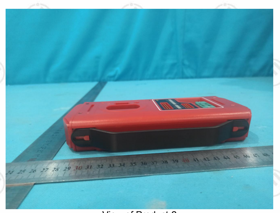
View of Product-2