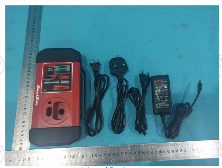
View of Product-1