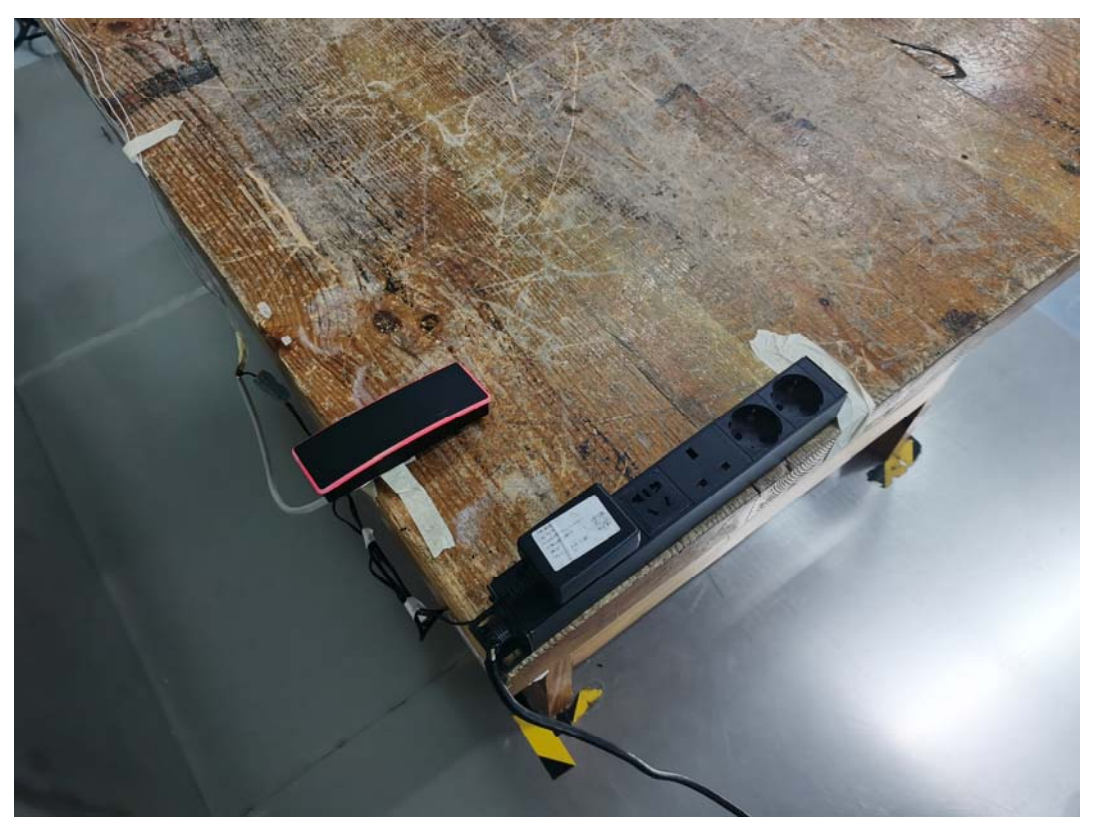
Conducted Emissions Side View- M2