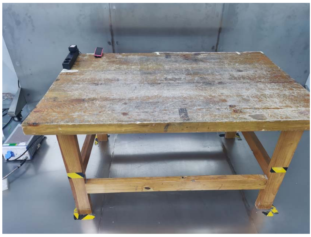
Conducted Emissions Front View-M2