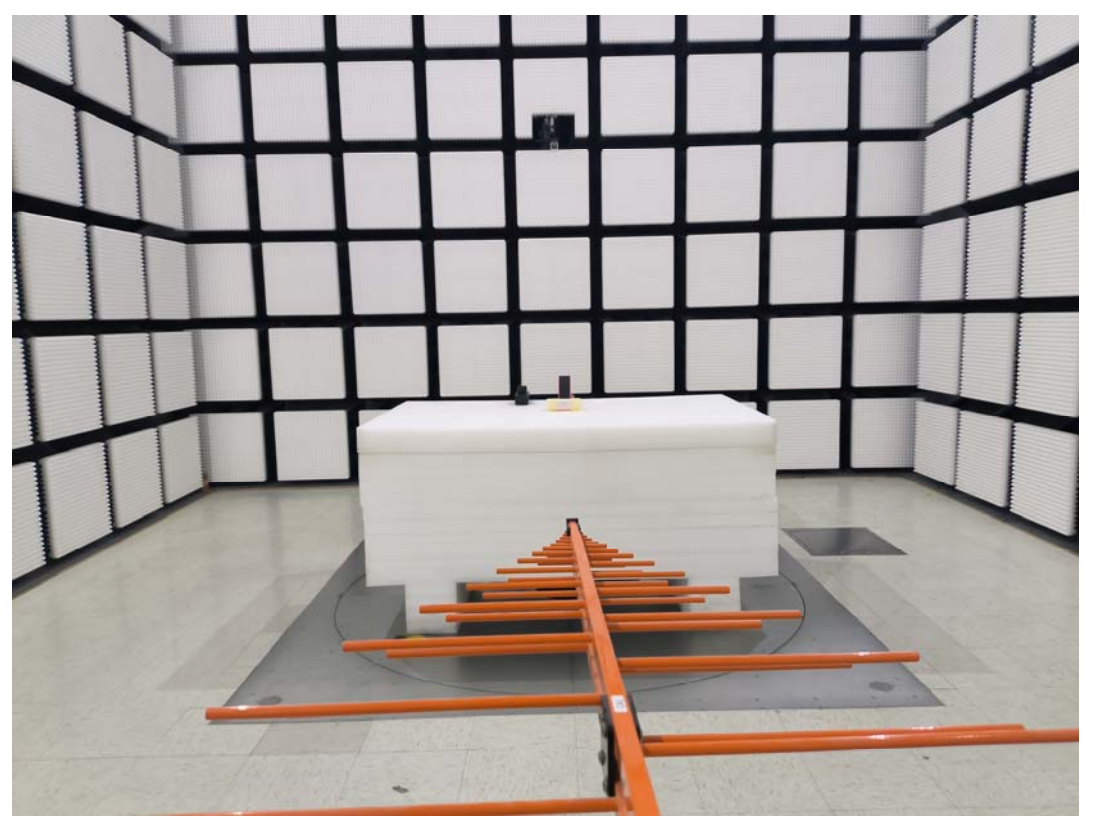
Radiated Emission Below 1GHz ViewM2