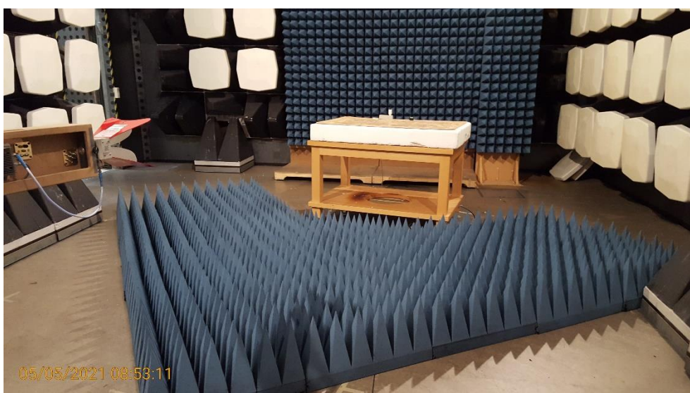
Photo 4. Radiated emission test setup. 1 - 18 GHz.