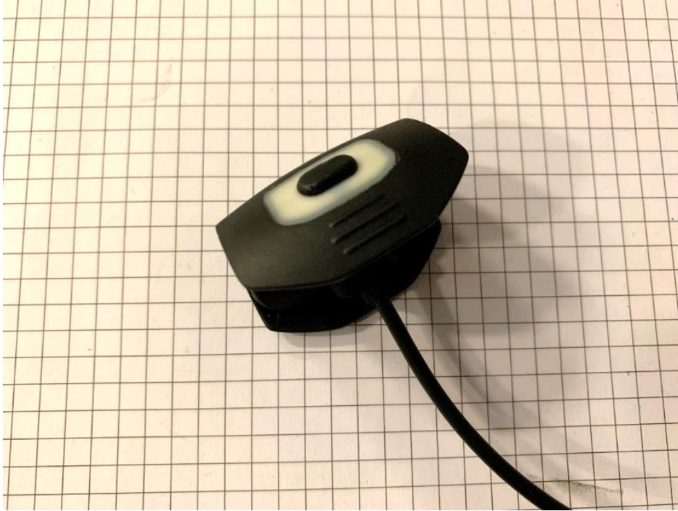
Photo 1. Test specimen. Charging + operational mode. Connected to power supply.