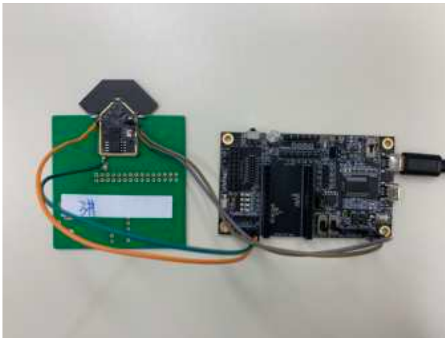
Figure 2: Hardware Connection