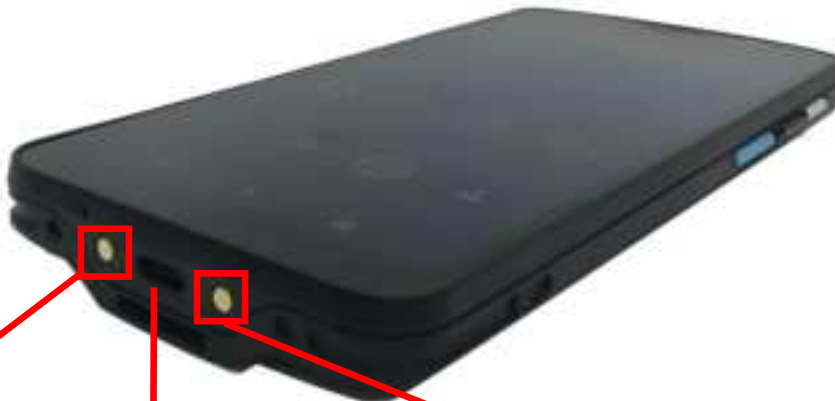
Pogo pin (For Cradle Charging)