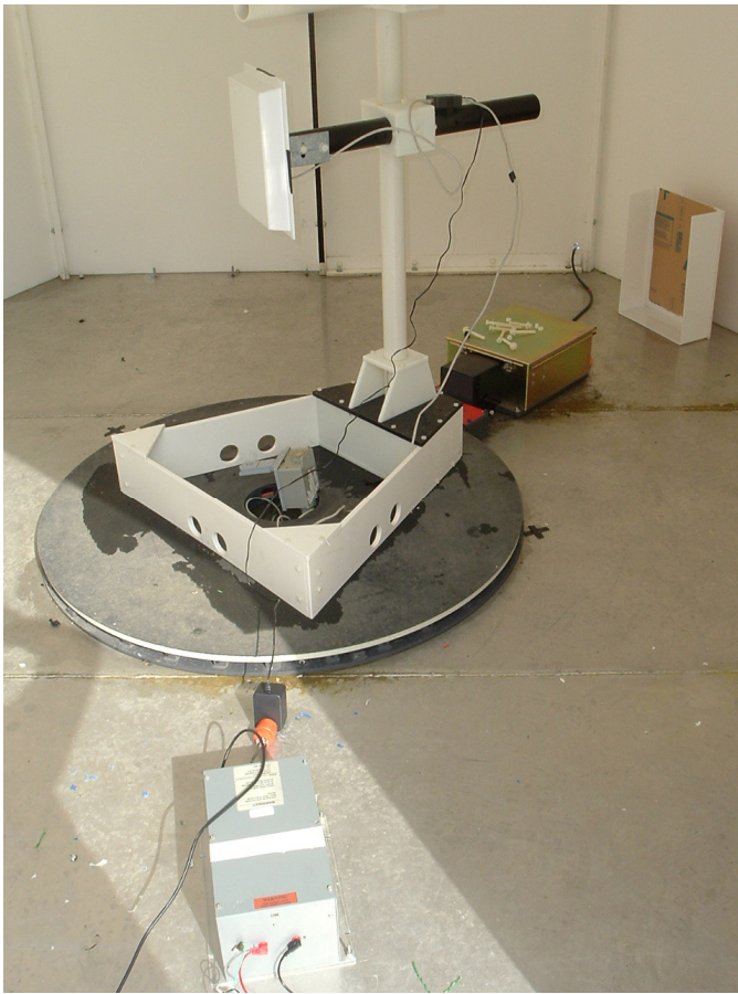
Conducted emissions test setup.