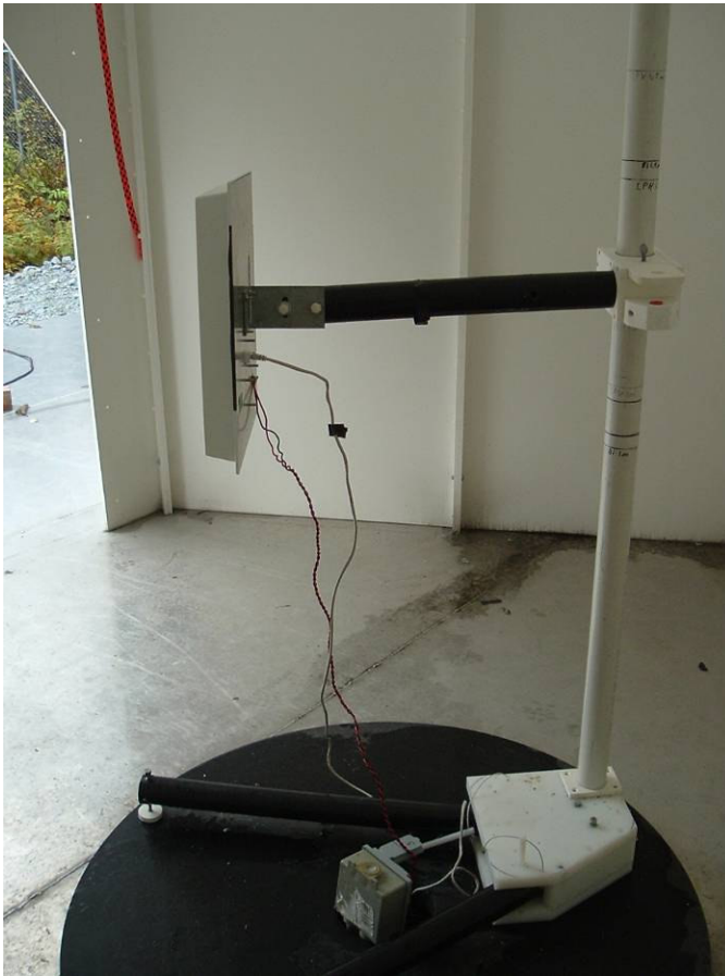
TR-6015 Radiated Emissions