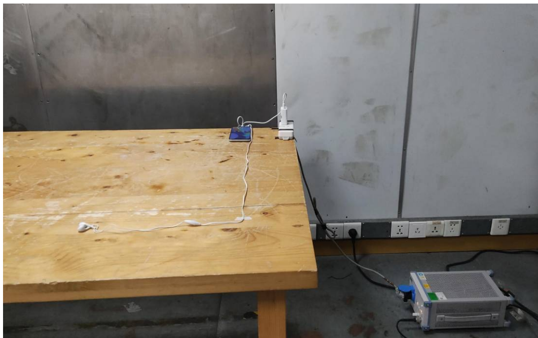
Photo of Conducted Emission Measurement