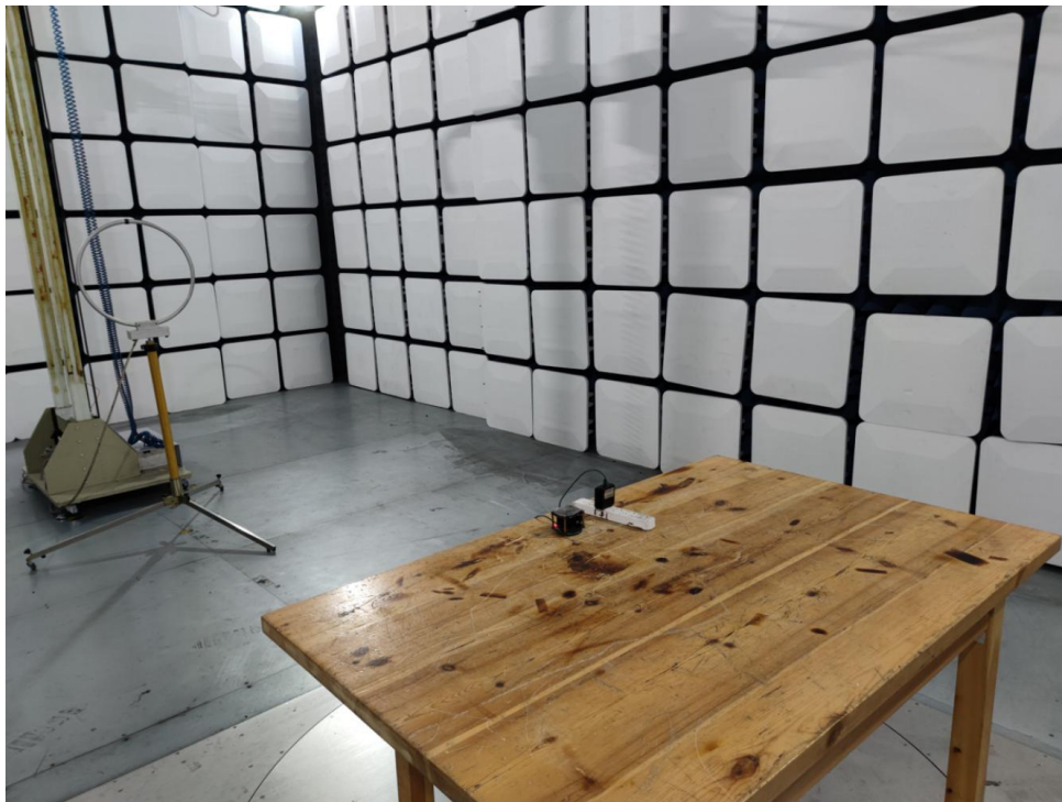
Photo of MPE Measurement