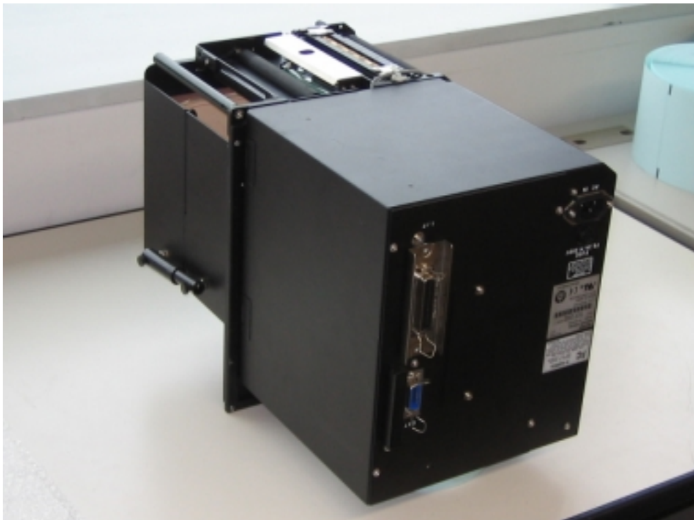
Back, left side and bottom of the printer