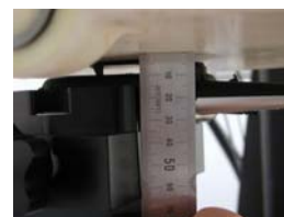
Figure 12. Body SAR Test Setup