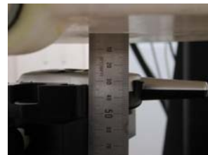
Figure 11. Mouth Face SAR Test Setup