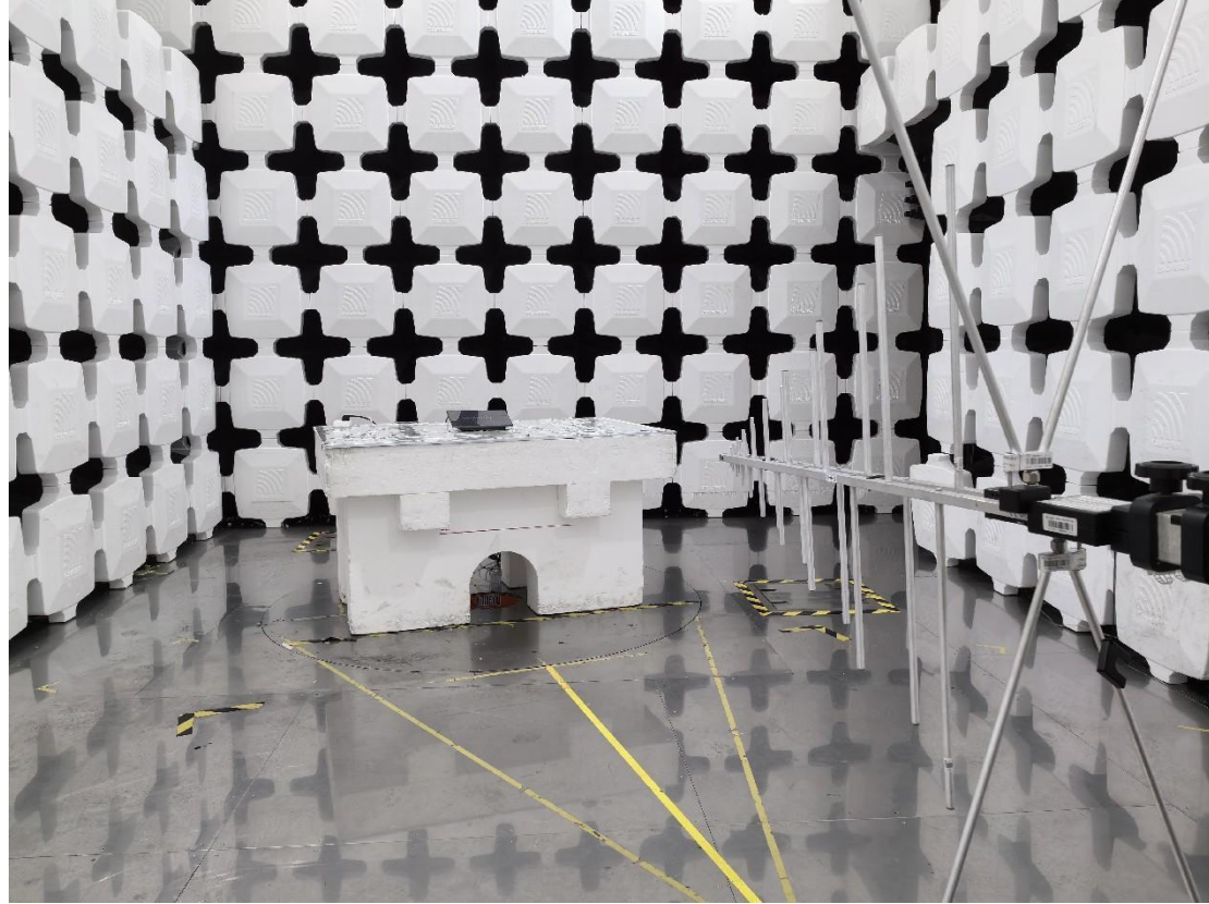
Radiated Emission Above 1G