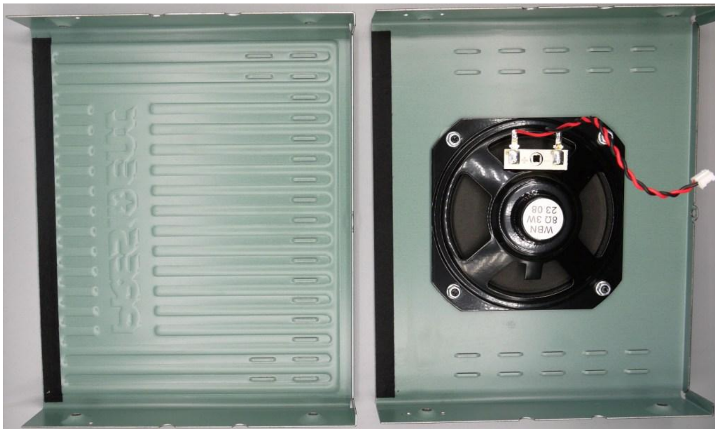
Figure E17.1 – Internal, Top and Bottom Covers