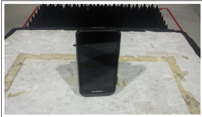
EUT Position: Z-axis