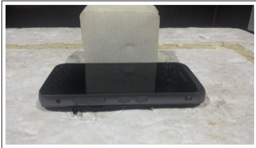
EUT Position: Y-axis