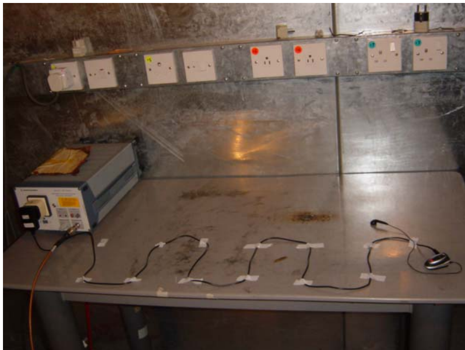
Set-up for Disturbance Voltage on AC mains