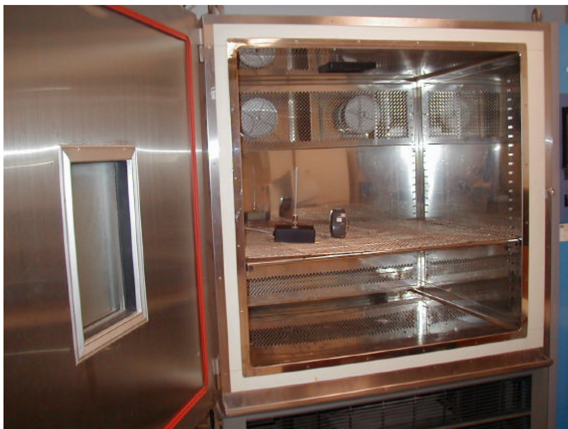
Temperature test chamber