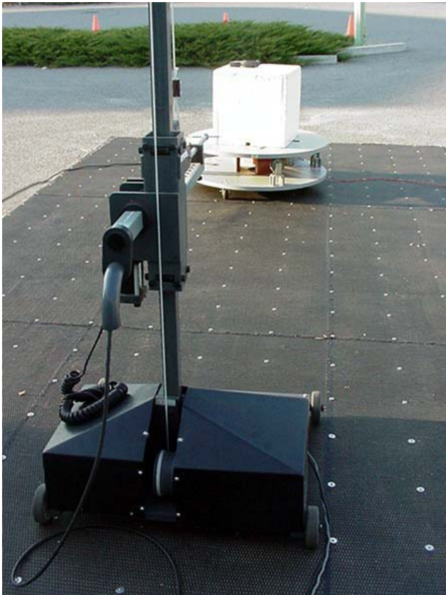
Cellular Band - Dipole Receive Antenna - Horizontal Polarization