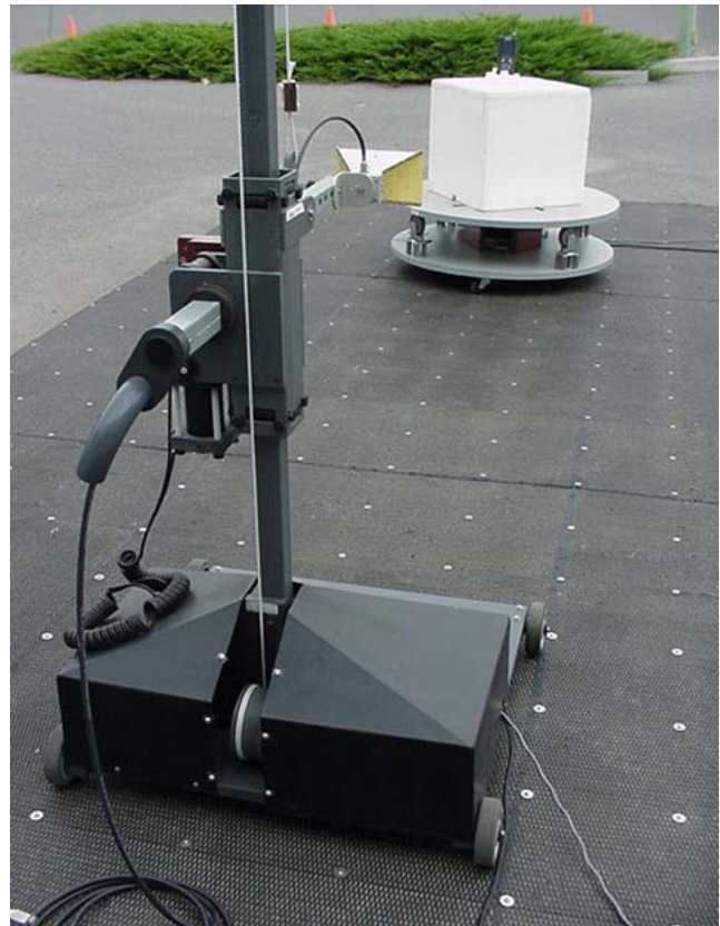
PCS Band - Horn Receive Antenna - Vertical Polarization