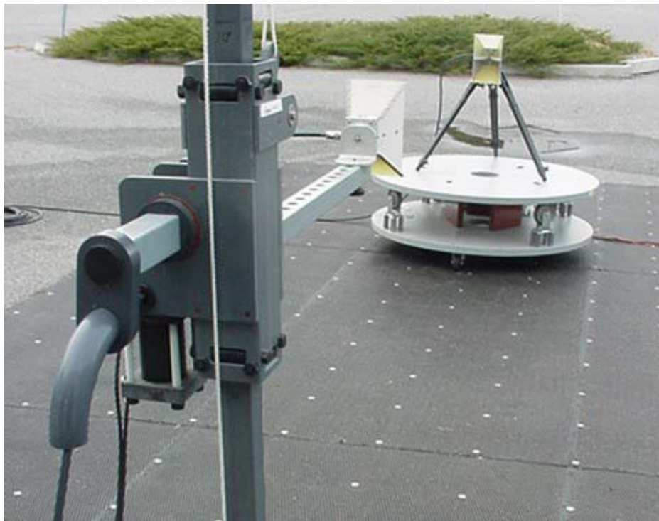
Signal Substitution - Horn Antenna