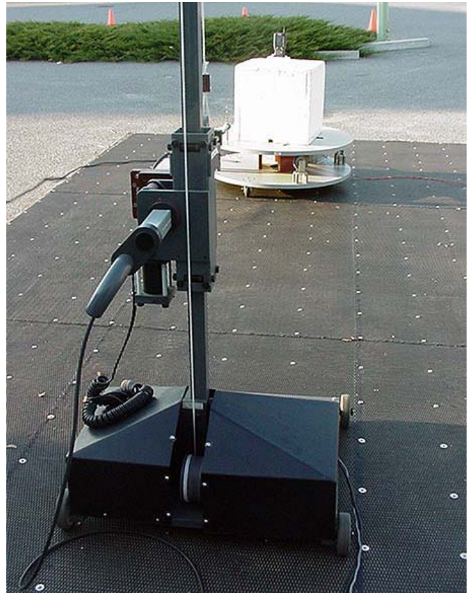
Cellular Band - Dipole Receive Antenna - Vertical Polarization