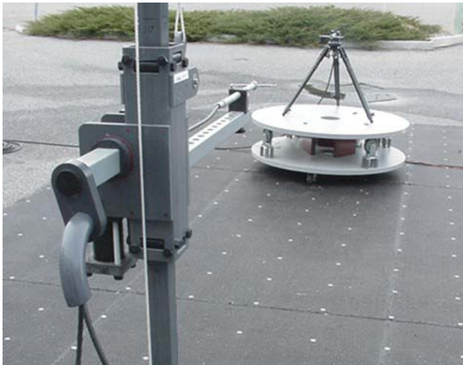
Signal Substitution - Dipole Antenna