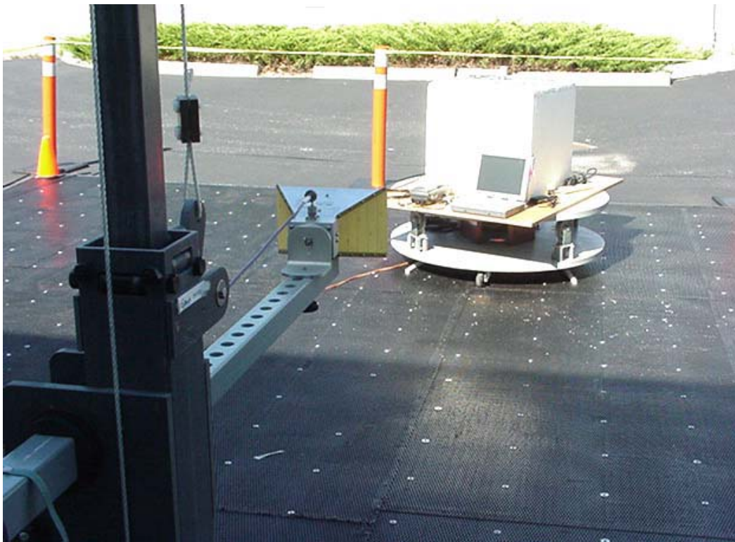
PCS Band with Horn Receive Antenna