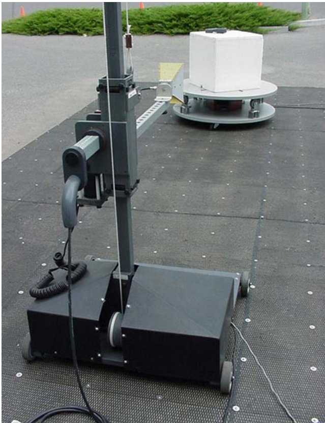
PCS Band - Horn Receive Antenna - Horizontal Polarization