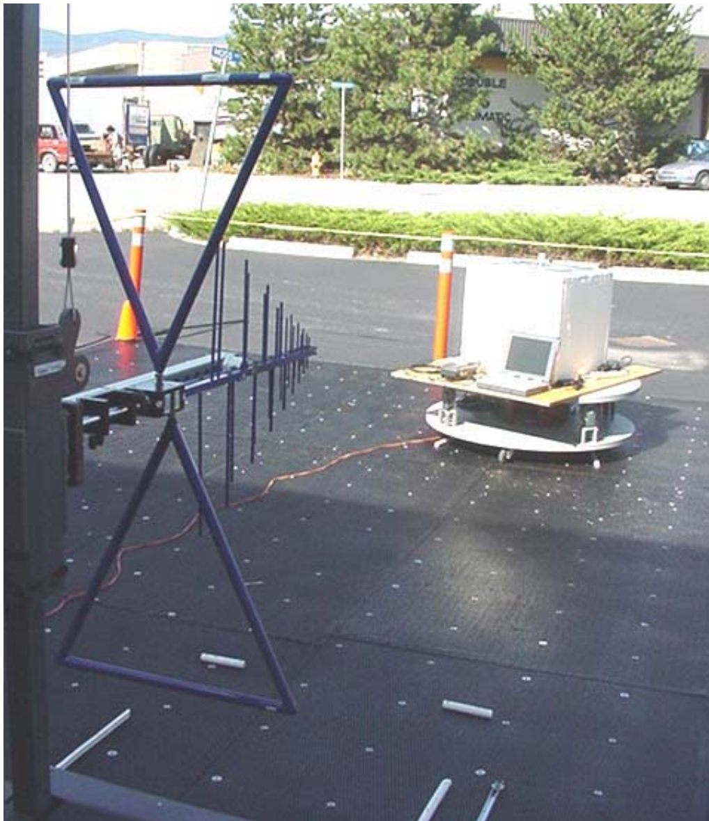
Cellular Band with BiConiLog Receive Antenna