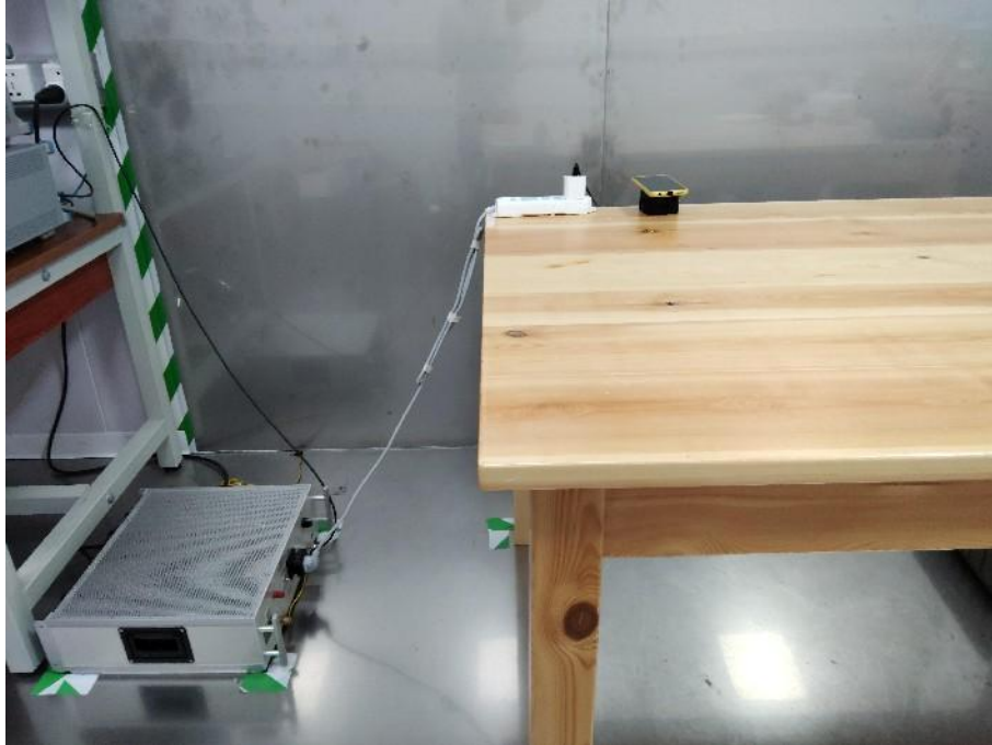
Radiated Spurious Emission (below 1GHz)