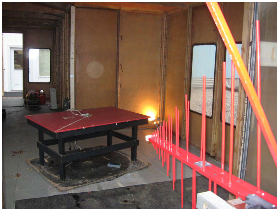
30 MHz – 1 GHz, Vertical Polarization