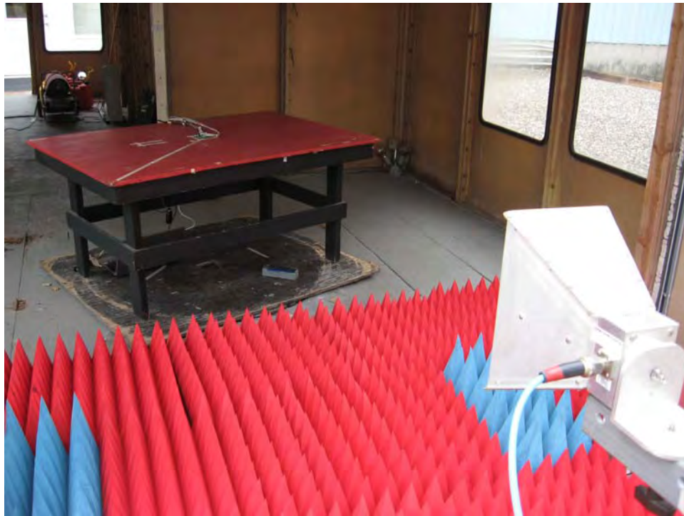
1 GHz – 10 GHz, Horizontal Polarization