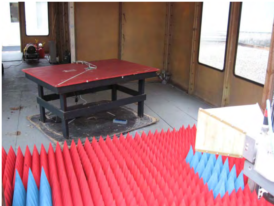
1 GHz – 10 GHz, Vertical Polarization