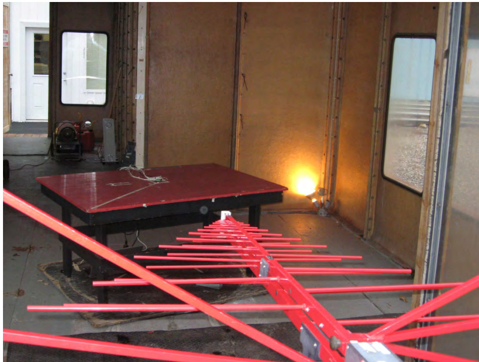
30 MHz – 1 GHz, Horizontal Polarization