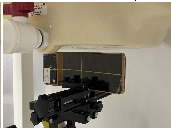
Right Side of EUT with 1 cm Gap