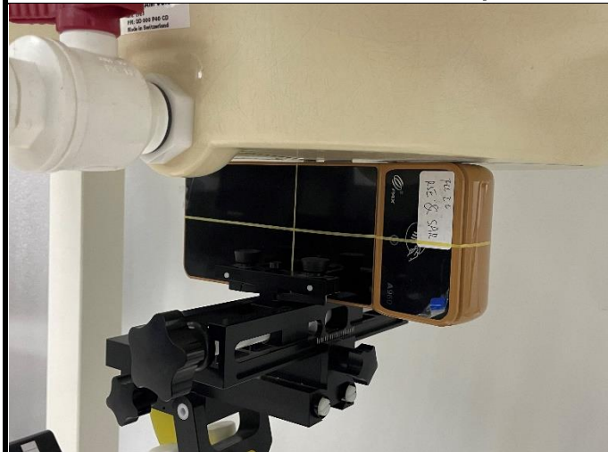
Left Side of EUT with 0 cm Gap