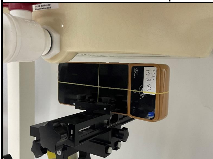
Left Side of EUT with 1 cm Gap