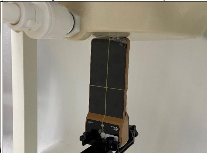
Bottom Side of EUT with 0 cm Gap