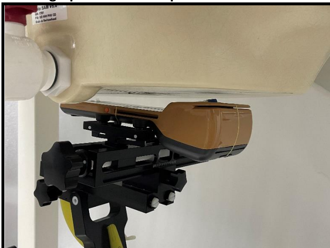
Front Face of EUT with 1 cm Gap