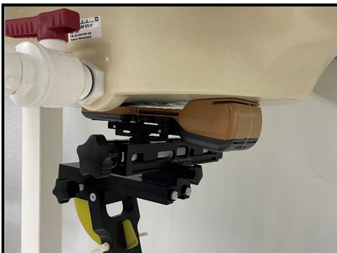
Front Face of EUT with 0 cm Gap