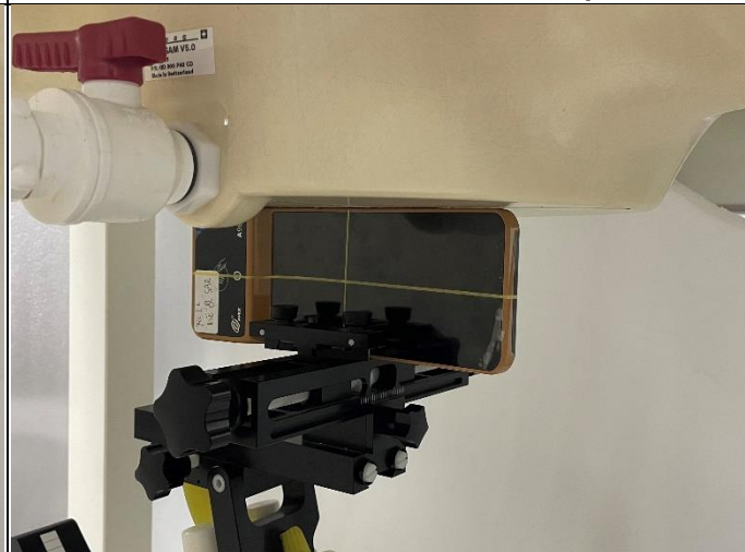
Right Side of EUT with 0 cm Gap