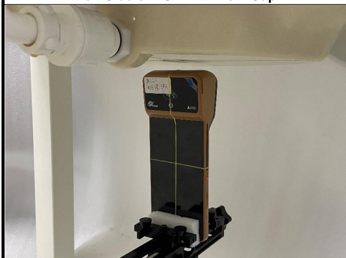
Top Side of EUT with 1 cm Gap