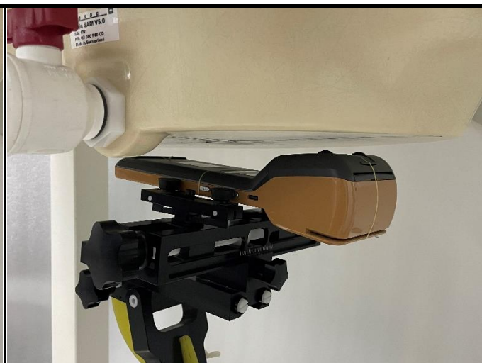
Rear Face of EUT with 1 cm Gap