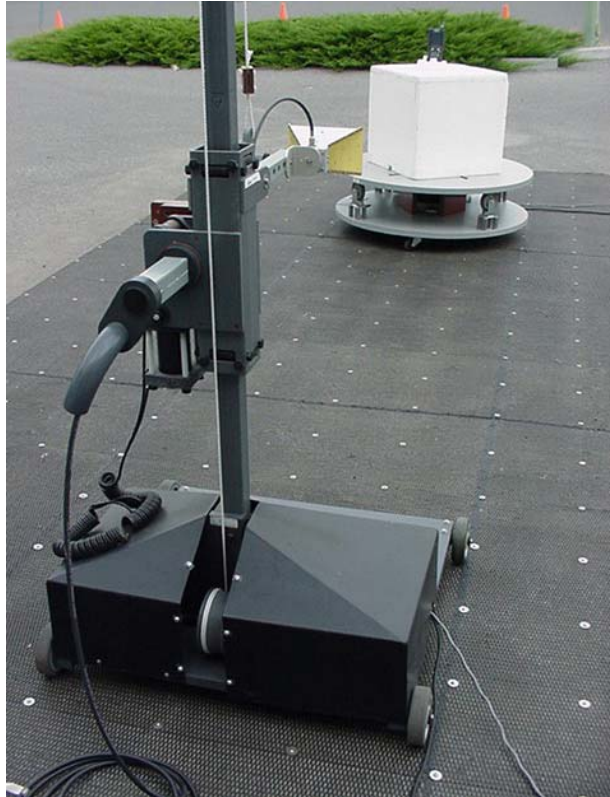
Photograph D.7-1 - Horn Receive Antenna with DUT Helix Antenna Configuration