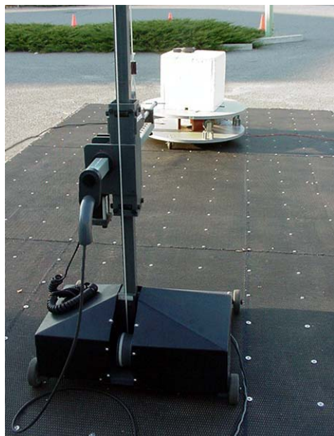
Photograph C.7-1 - Dipole Receive Antenna with DUT Helix Antenna Configuration