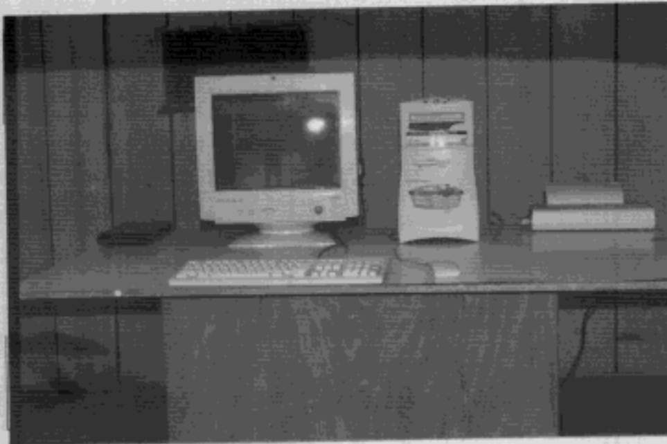
Front View of Radiated Measurement