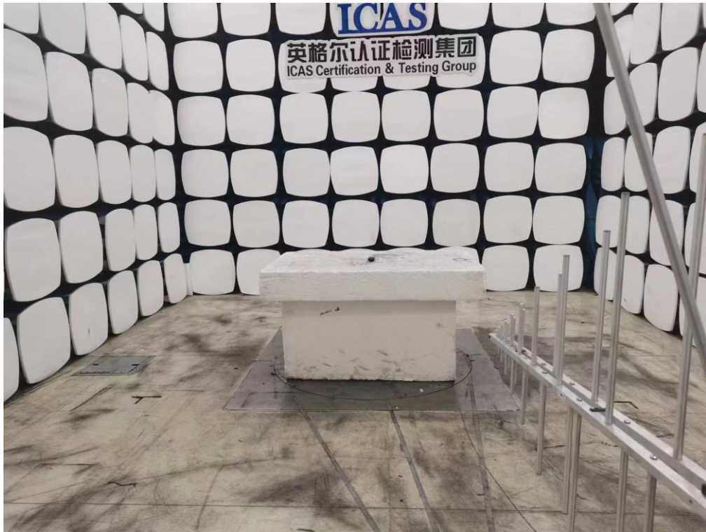
Below 1 GHz