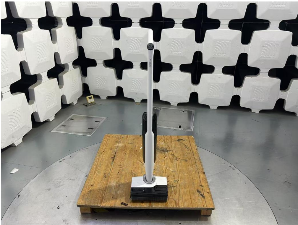
Below 1GHz (The EUT was placed in the center of the turntable)