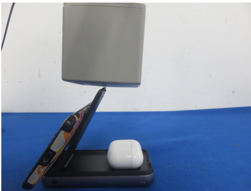
Photo of MPE Measurement at 20 cm