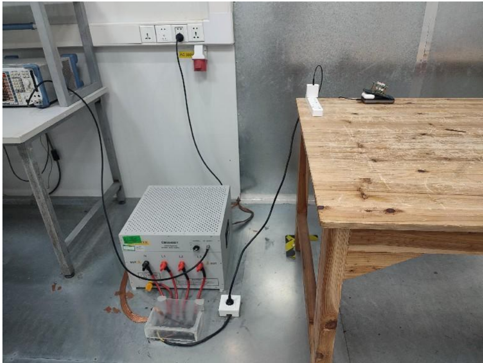
Photo of Radiation Emission Test