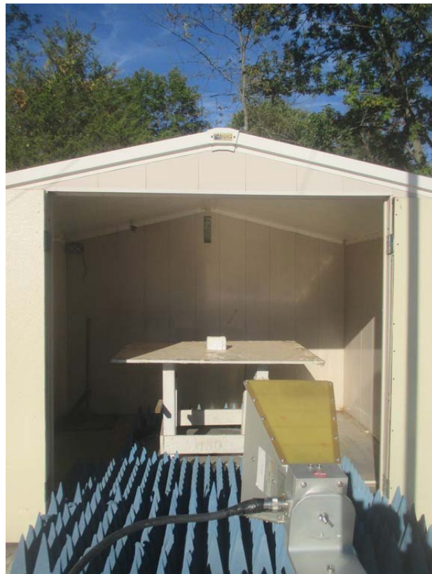
Figure 3.1 Radiated Test Setup