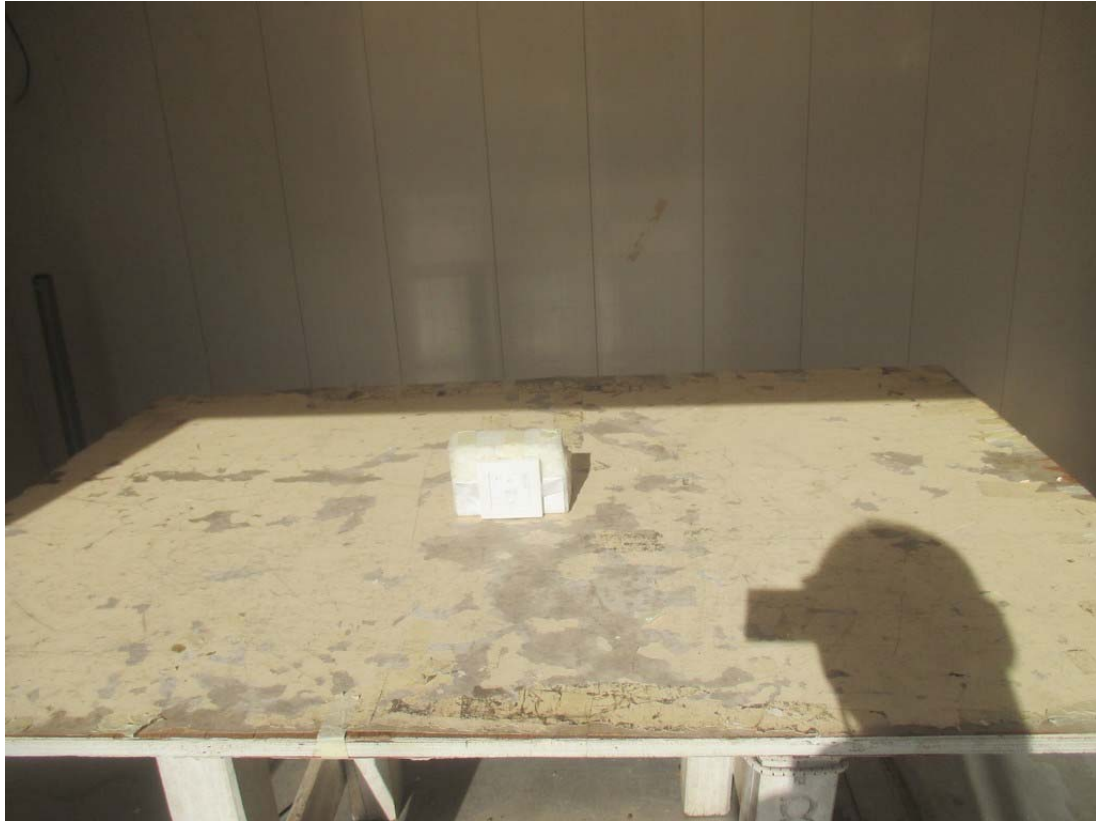
Standard Orientation (Z)