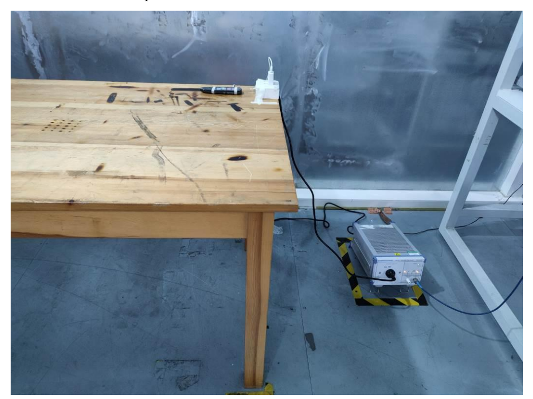
AC Conducted Emission of charge from power adapter mode