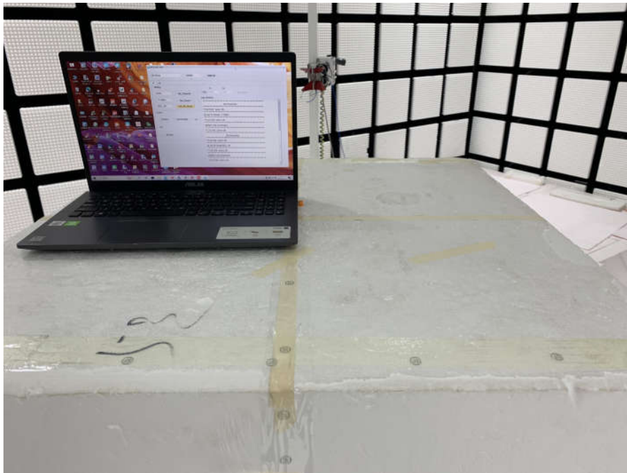
Radiated spurious emission Test Setup-2 (Above 1GHz)