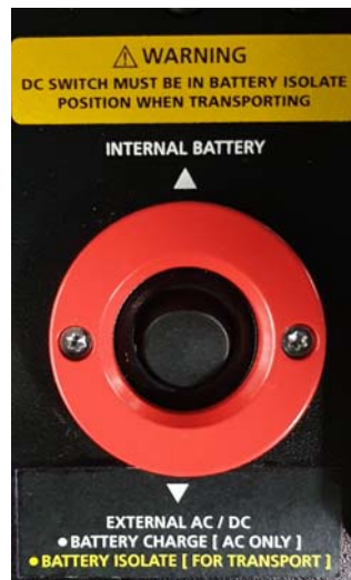
Figure 3.1 Battery select switch

The battery select switch is protected with a raised red surround to avoid accidental switching on when the lid is closed.