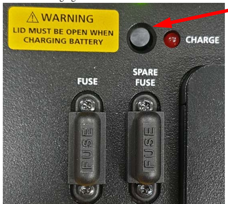
Figure 3.2 Recessed charge button

Notice Press the recessed button located at the left of the Charge LED to turn charging off and on.